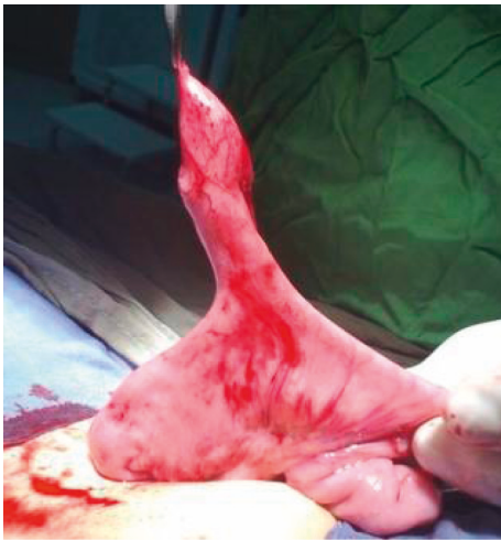
FIGURE 3: An intraoperative picture showing a Meckel's diverticulum that caused bleeding per rectum and the histopathology showed the presence of an ectopic gastric mucosa.

mucosa within the diverticulum. Some authors document that resection of the segment of the bowel that contains the diverticulum followed by primary anastomosis is preferable to wedge resection or tangential mechanical stapling due to the risk of leaving behind an abnormal heterotopic mucosa. [4, 5, 8, 9].