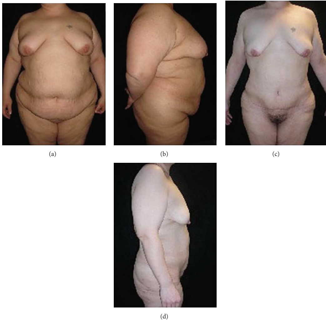
FIGURE 8: (a) Preoperative frontal view and (b) lateral view of a female patient (BMI = 45 kg/m 2 ; body weight = 133 kg). (c) Postoperative frontal view and (d) lateral view 18 months after surgery (body weight = 72 kg).

[11]. Bariatric surgery combined with panniculectomy may be performed using a laparoscopic approach. Further studies combining panniculectomy with laparoscopic bariatric surgery are necessary for comparison of results obtained by the different techniques.