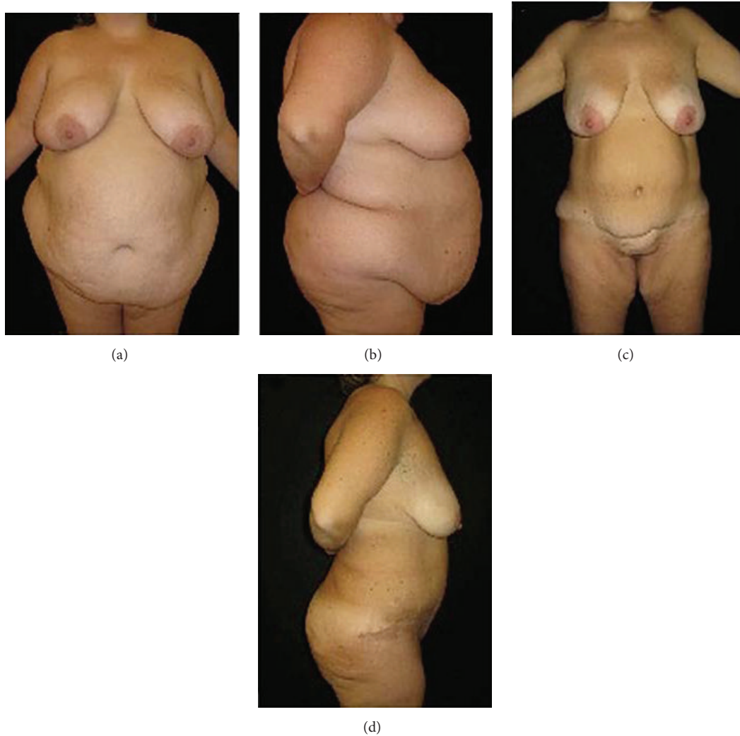
FIGURE 7: (a) Preoperative frontal view and (b) lateral view of a female patient (BMI = 55 kg/m 2 ; body weight = 147 kg). (c) Postoperative frontal view and (d) lateral view five years after surgery (body weight = 67 kg).

reported by Igwe Jr. et al. [4] for both combined and post-bariatric panniculectomy (Table 6). Therefore, the surgical experience acquired during the study period decreased operating time and hospital stay, motivating us to extend the indications of panniculectomy combined with bariatric surgery by laparotomy.