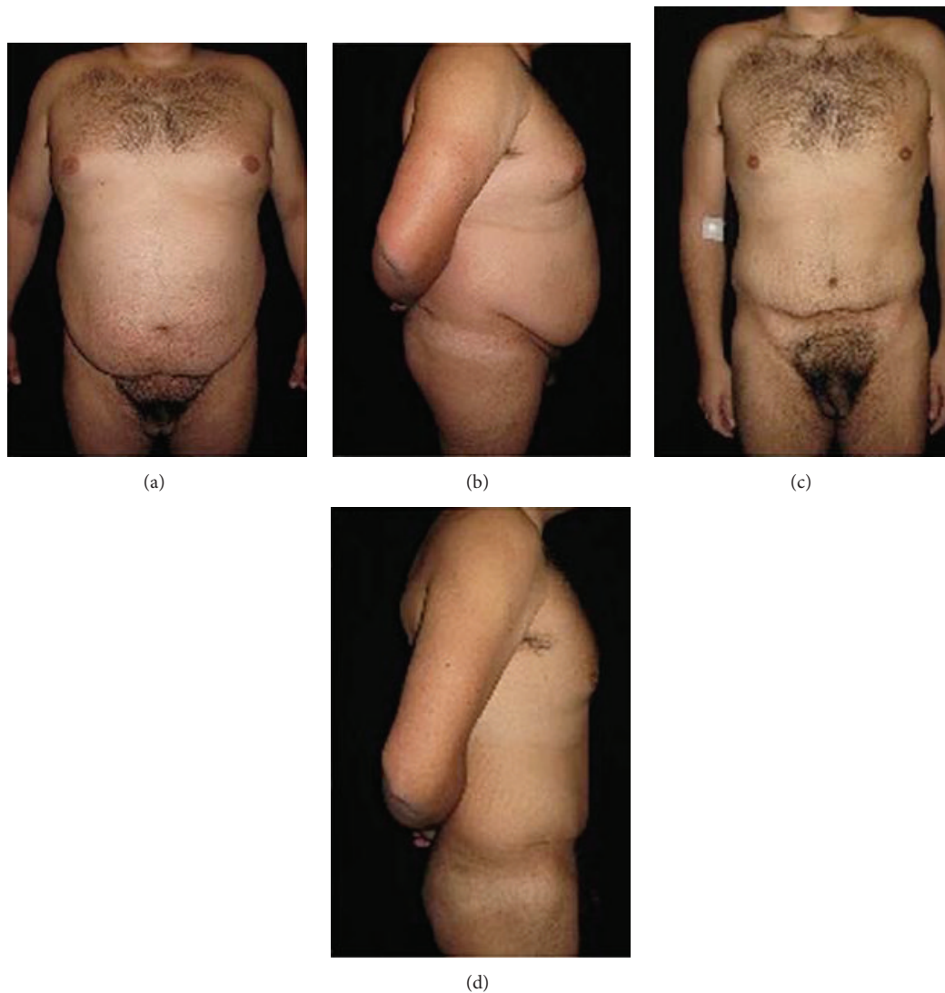
FIGURE 2: (a) Preoperative frontal view and (b) lateral view of a male patient (BMI = 44 kg/m 2 ; body weight = 136 kg). (c) Postoperative frontal view and (d) lateral view five years after surgery (body weight = 73 kg).

abdominal vasculature. The described dissection, although limited, allows the creation of an operative field sufficient to perform the entire procedure.