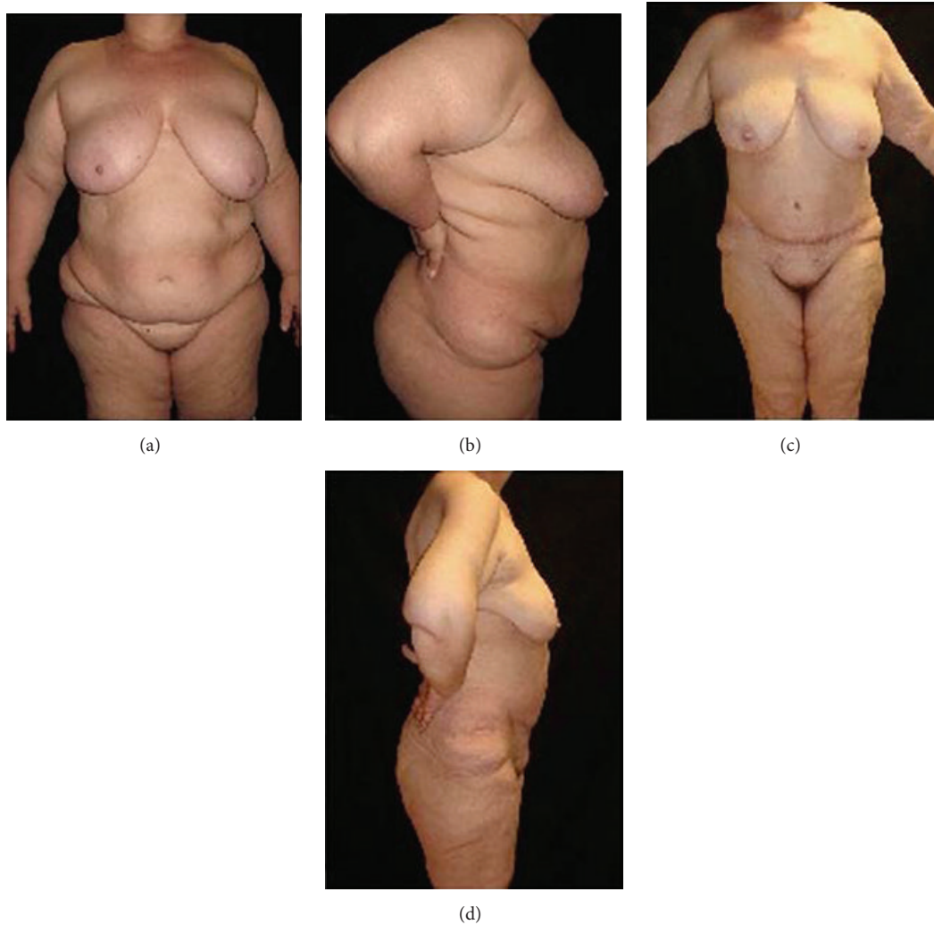
FIGURE 5: (a) Preoperative frontal view and (b) lateral view of a female patient (BMI = 39 kg/m 2 ; body weight = 106 kg). (c) Postoperative frontal view and (d) lateral view 11 months after surgery (body weight = 71 kg).