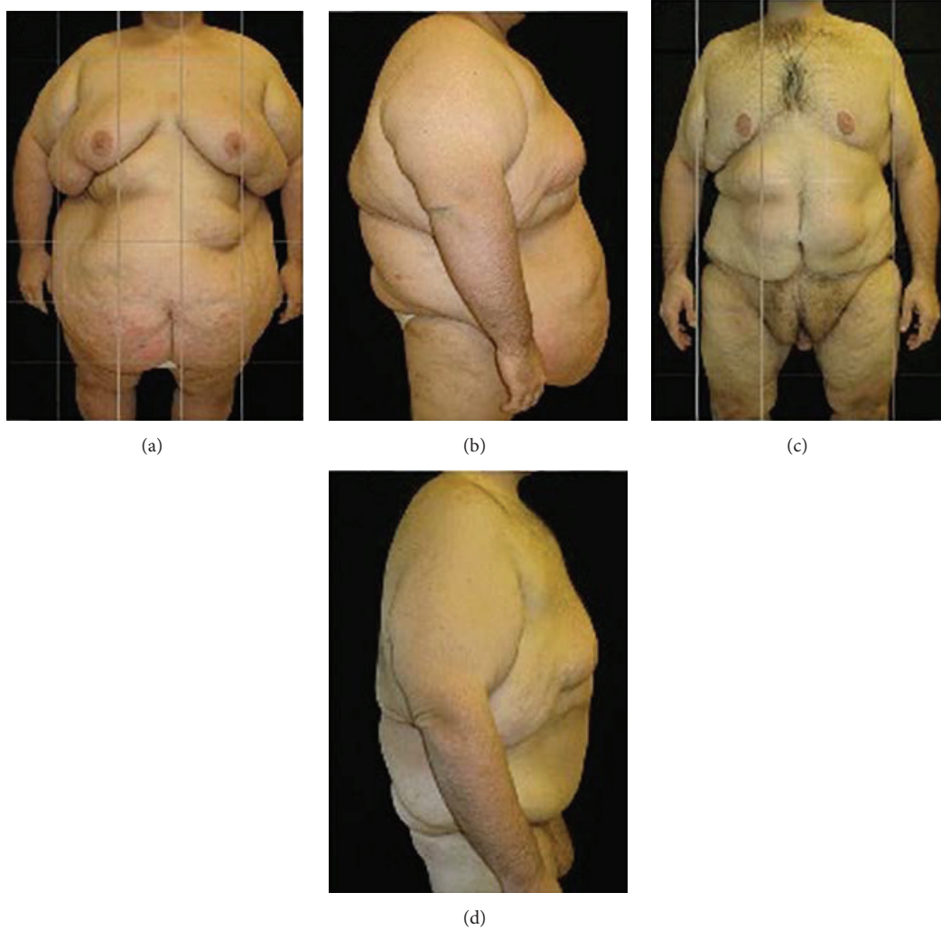
FIGURE 3: (a) Preoperative frontal view and (b) lateral view of a male patient (BMI = 69.9 kg/m 2 ; body weight = 220 kg). (c) Postoperative frontal view and (d) lateral view five years after surgery (body weight = 110 kg).