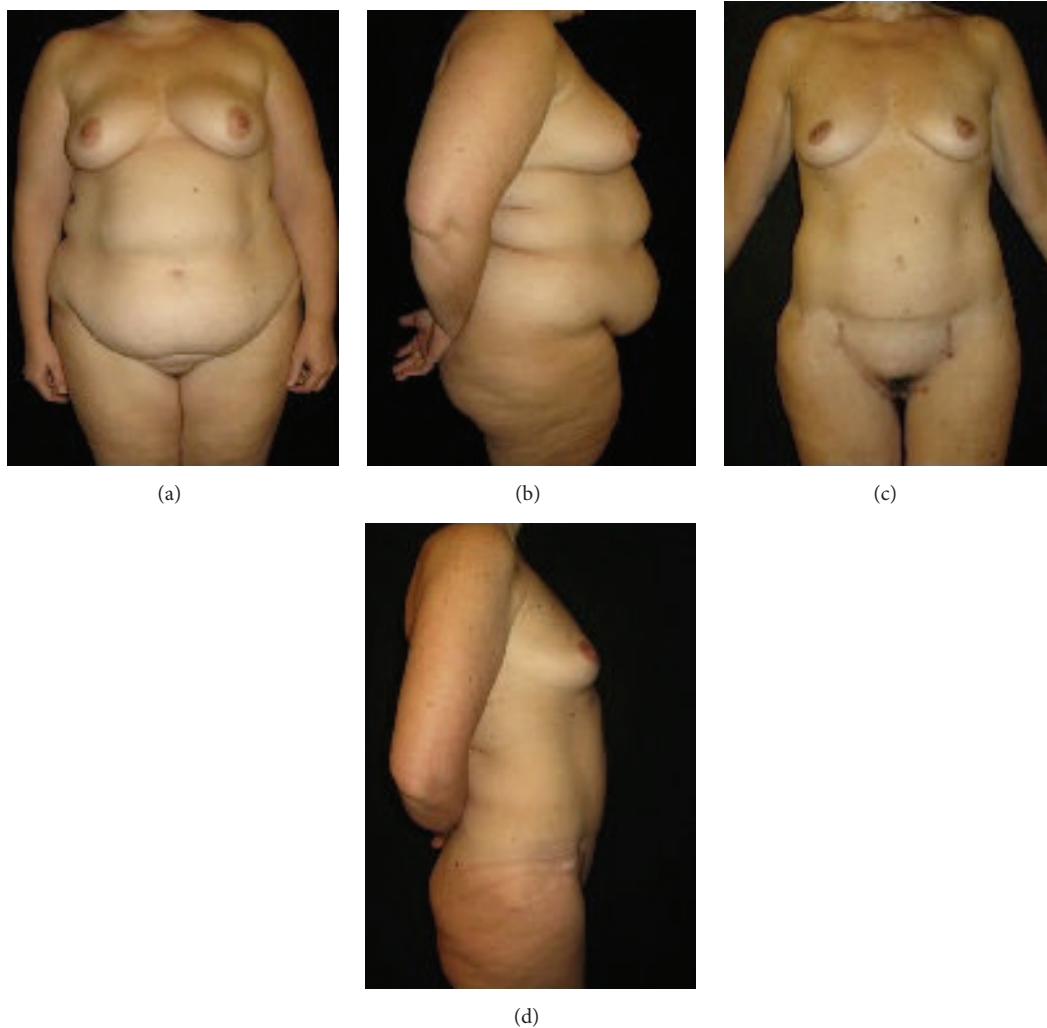
FIGURE 4: (a) Preoperative frontal view and (b) lateral view of a female patient (BMI = 50 kg/m 2 ; body weight = 135 kg). (c) Postoperative frontal view and (d) lateral view three years after surgery (body weight = 65 kg).

Gillies stitches using 4-0 nylon suture (avoiding its fixation to the muscle fascia), leaving a stump of length similar to the thickness of the dermal-fat flap. This preventive measure is useful to reduce the mechanical stress on the umbilicus, which is already burdened by the partial devascularization caused by the undermining of the skin.