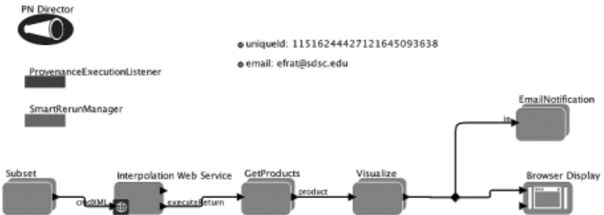
Fig. 2. An executable workflow instance example created on the fly from the workflow template based on the user selections.

reusable building block components. The LiDAR processing workflow, depicted in Fig. 1, provides a conceptual workflow where each of the components can be dynamically customized by the availability of the data and processing algorithms and is set on the fly prior to the workflow execution (Fig. 2 gives a snapshot of the top level of an instantiated workflow instance). This modularized approach can be captured as a workflow pattern of subset , analyze , and visualize . Below we elaborate on each of the processing steps.