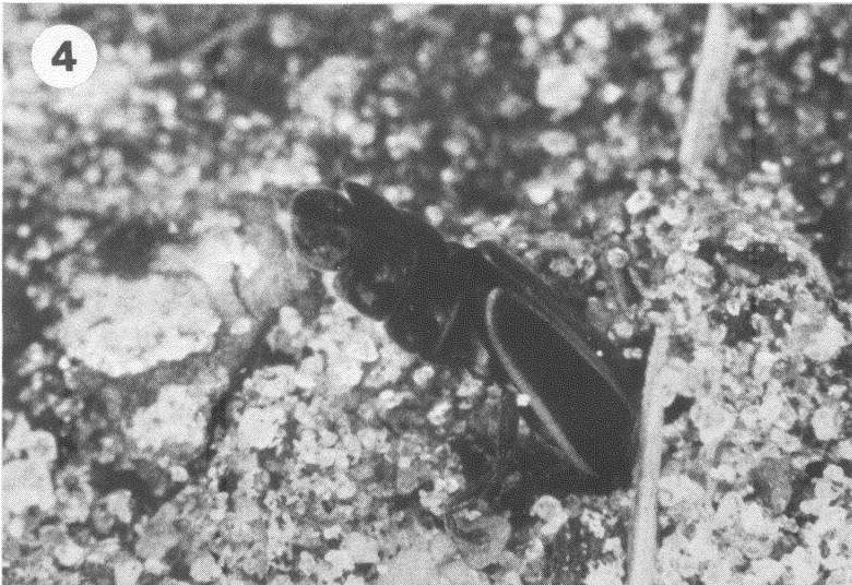
Fig. 3. Rival male (left) remains mounted as female enters burrow. Male on right is copulating. Fig. 4. Rival male digs at female's burrow.