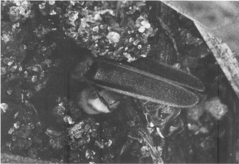
Fig. 5. Rival male pulls female from her burrow.