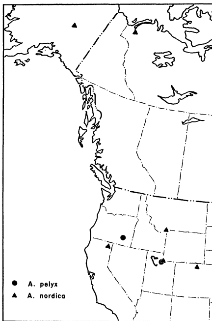
Map 1. Distribution of Arctachaea nordica (Chamberlin and Ivie) and A. pelyx new species.

Description. Carapace white, with a double median line and a dusky border. Sternum with a narrow dusky border. Legs white. Eyes on small black spots, anterior medians