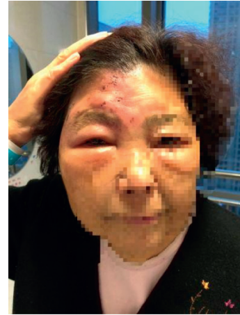
FIGURE 2: State of the right upper eyelid five days after intravenous administration of vitamin C.

4.1. Herpes Zoster-Associated Pain and Several Analgesic Mechanisms of Vitamin C. Studies have shown that the decline of cell-mediated immune function plays a critical role in the reactivation of VZV infection and the development of PHN; therefore, investigating the role of immune-relevant micronutrition from the therapeutic point of view is worthwhile [2–4, 32]. VZV remains dormant in the spinal or cranial sensory ganglia after primary infection earlier in life and becomes reactivated afterwards, traveling down the sensory root