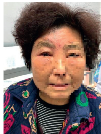
FIGURE 3: State of the right upper eyelid one week after discharge from hospital (28 days after the onset of rash).

ganglia to cause damage to peripheral and central neurons, ultimately resulting in an inflammatory immune response [33].