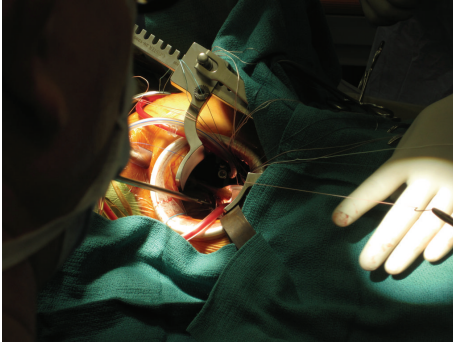
FIGURE 1: Level 2 minimally invasive approach (4–6 cm incision).