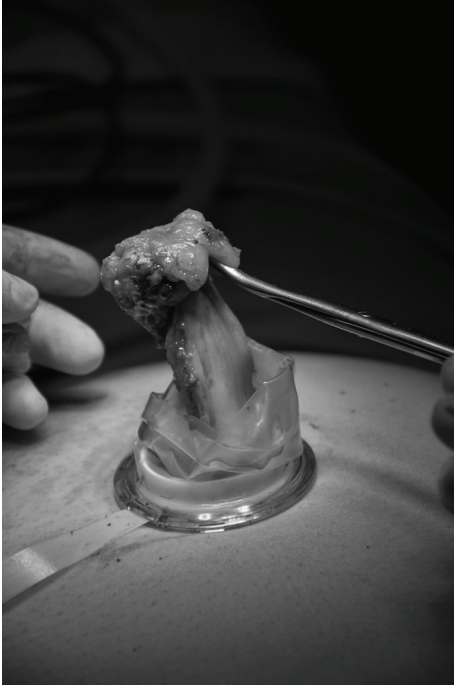
FIGURE 1: Safe removal of the gallbladder through the TriPort system without an endobag.

by three experienced surgeons in standard technique. Single-incision operation using two 5 mm and one 10 mm trocar was performed in 24 patients (11%) between October 2008 and January 2009. Patients with symptomatic acute and chronic gallbladder disease were included in the observation, and all operations were performed consecutively. Exclusion criteria for single-incision surgery were patients with gallbladder perforation, diagnosed in ultrasound or CT scan, with peritonitis or severe critical illness. All patients were hospitalized for at least two days and were completely informed about the single-incision technique. All patients had the choice to undergo traditional three-port procedure.