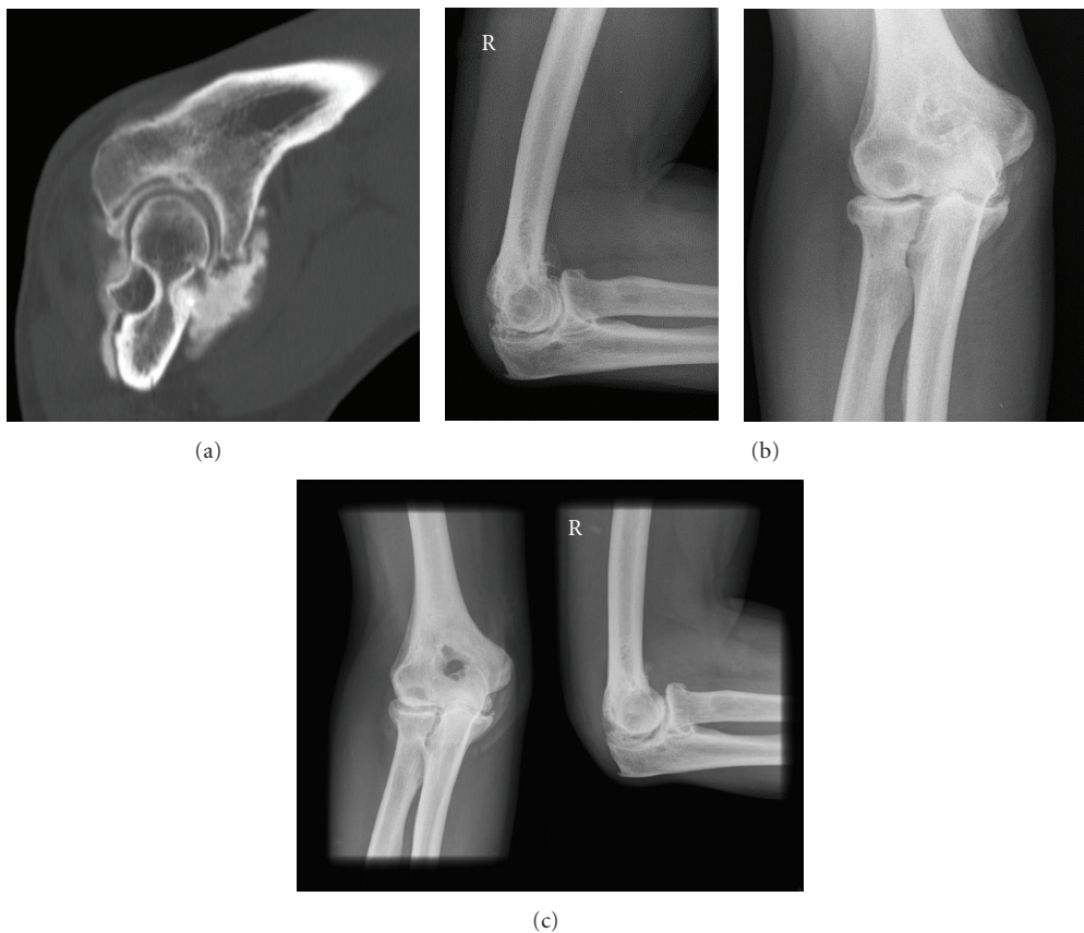
FIGURE 2: Radiological assessment with CT scan of early cubarthrosis shows the posterior impingement in extension (a). Pre- (b) and postoperative (c) X-rays of the perforation of the distal humerus.