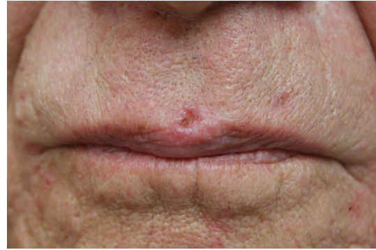
FIGURE 1: BCCs on the upper mid lip before PDL treatment.

PDL was well tolerated by all of the patients with minimal short-term pain (few minutes) during procedure. Only few patients requested local anesthesia on follow-up treatments (about 1/3 of the patients and this did not correlate with