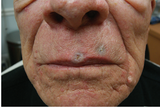
FIGURE 2: BCCs on the upper mid lip immediately after PDL treatment.

and desiccation are effective with over 90% clearance rates [2]. However, they can be time-consuming, expensive, and fraught with potential side effects [2]. Nonsurgical treatments, chemotherapy, immunomodulator topical therapies, and photodynamic therapy have less risky side effects [3]. However, they likewise can be time-consuming, bothersome to apply, uncomfortable, and deliver lower and unreliable efficacy rates based on application compliance and subtypes of treated BCCs [3]. Therefore, there is currently a search for unconventional, effective, safe, tolerable, and affordable therapy, such as laser therapy. Our case series demonstrates usefulness of PDL therapy for BCCs.