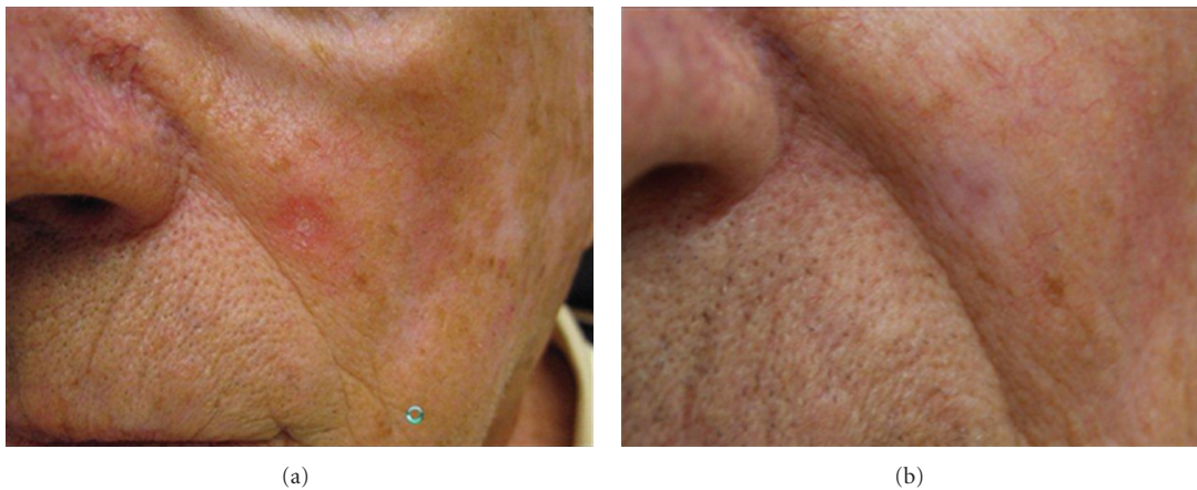
FIGURE 4: BCC on the left cheek, before and three months after PDL treatment. Complete resolution of the lesion.

the size of the tumors which is helpful for patients that are interested in pursuing further alternative treatment options (e.g., Mohs surgery), especially in cosmetically pertinent areas [4, 5, 8]. On the other hand, PDL treatment of BCCs also has its drawbacks, such as lack of universal access to laser therapy, requirement of several in-office treatments, and lower response rate compared to more traditional therapies (e.g., surgical and destructive methods), as seen in our study.