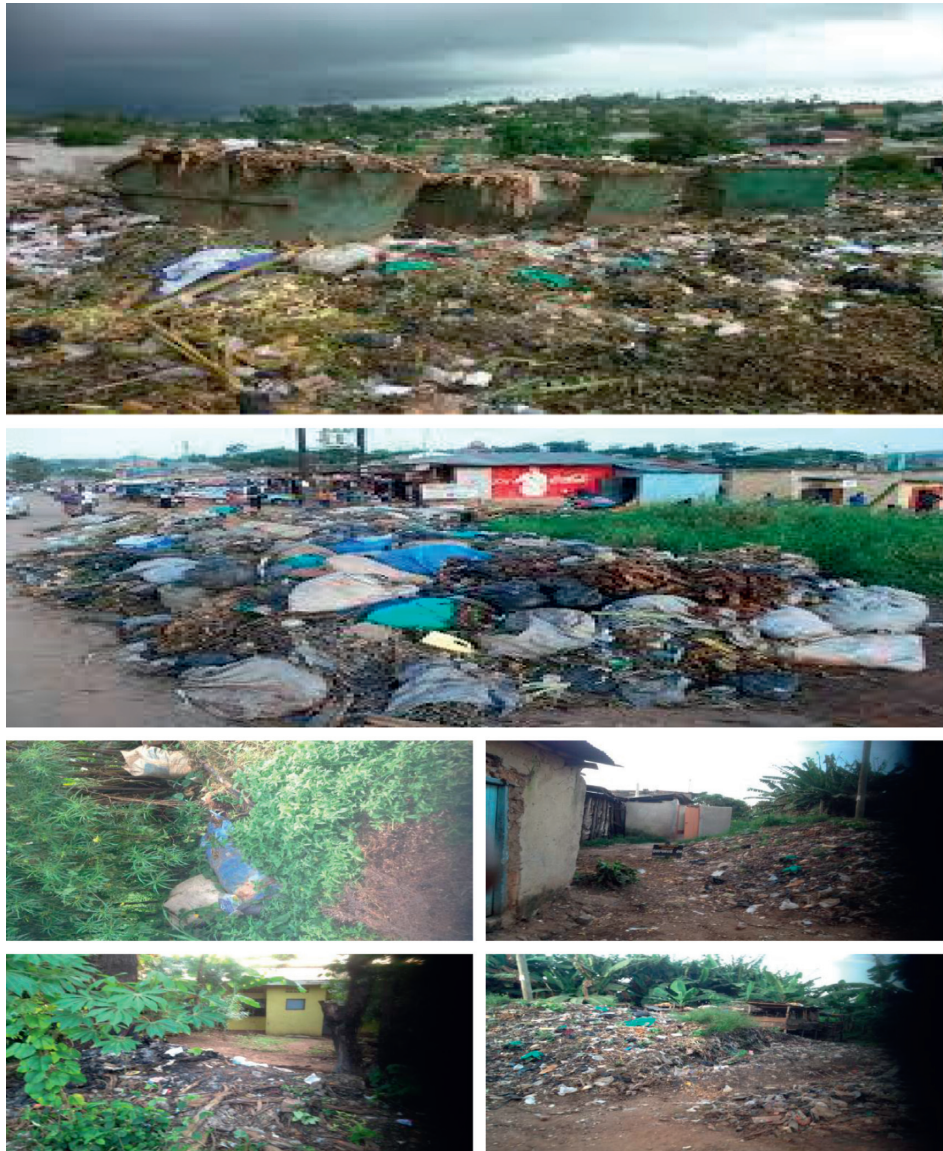
FIGURE 2: Uncollected waste in different parts of Mbarara Municipality.