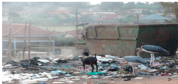
FIGURE 3: Uncollected garbage in Kakyeka area.

Kenkombe; interview, Kakoba Division Council Official, 14 May 2019). This can hardly be turned into manure that can generate money expected to cover solid waste management