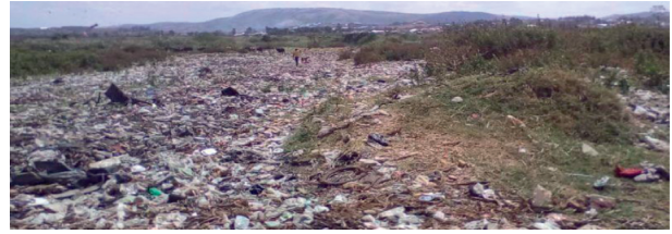
FIGURE 4: Uncollected garbage in Kenkombe waste dumping site.