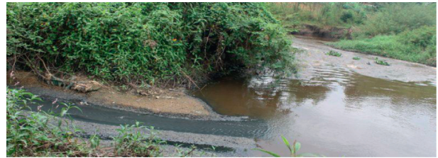
FIGURE 5: Untreated industrial waste flowing into River Rwizi.