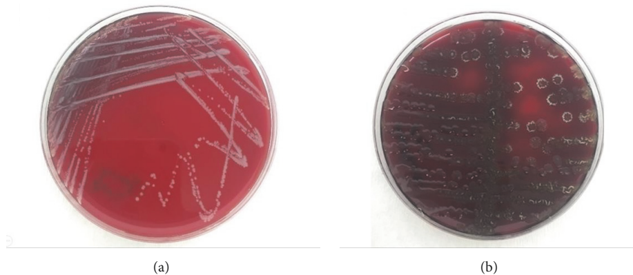
FIGURE 2: The colony appearance of coagulase-negative staphylococci (2a) and the appearance of bacillus spp. (2b) in SBA after contact.