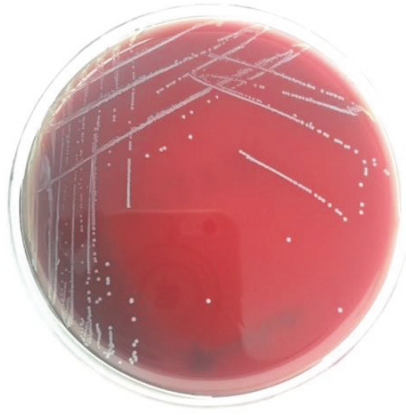
FIGURE 3: Enterococcus spp. reproducing after contact.

pathogenic or potential pathogenic bacteria were detected, and most commonly coagulase-negative staphylococcus reproduced [12].