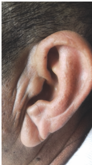
FIGURE 1: Diagonal earlobe crease in an Atahualpa resident.

Atahualpa residents aged \geq 60 years were invited to participate for evaluating the association between the presence and characteristics of ELC and results of ABI determinations, after adjusting for relevant confounders.