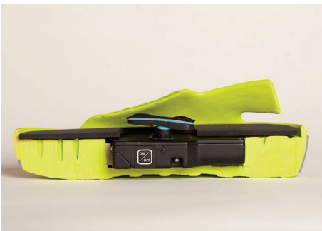
FIGURE 2: A lateral cross-section of the MMC sandal showing the embedded compression device in the sole. The pressure pad is in the elevated position.