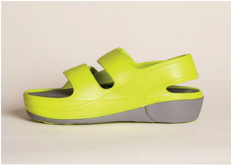
FIGURE 1: The MMC sandal which houses the compression device within the sole.