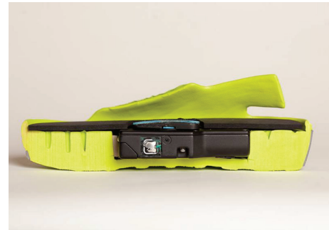
FIGURE 3: A lateral cross-section of the MMC sandal showing the embedded compression device in the sole. The pressure pad is in the retracted position.

For the outcome measures, a mixed linear model was used, with covariates including the baseline measurement, a term for the randomisation (right versus left leg), time (two measurements at 30 and 60 minutes), and a time by treatment interaction term. The time by treatment interaction term tests if the difference between treatments is of the same magnitude at 30 minutes and 60 minutes. If this term is not statistically significant, then the main effect of treatment is the difference between treatments averaged over the two measurement times. The analysis used, adjusting for baseline (as a covariate), gives narrower confidence intervals than a change from baseline analysis. Participants were treated as