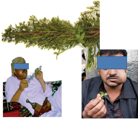
FIGURE 1: Khat tree and how khat users chew and keep it for few hours in their mouth cavity.

Khat contains several components, mainly a monoamine alkaloid called cathinone, which is an amphetamine-like stimulant that is responsible for most effects of khat, including excitement, loss of appetite, and euphoria [10, 11].