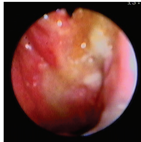
FIGURE 1: A 32-year-old woman, nasopharyngeal examination shows irregular redness mucosa and white patch covers the nasopharyngeal area.

6.1. Imaging. Computed tomography (CT) and magnetic resonance imaging (MRI) were reported as valuable tools in head and neck TB, demonstrating the sites, pattern, and extension of the disease [42, 43]. In addition, finer details of lesion detected from MRI imaging were helpful in distinguishing nasopharyngeal diseases [42]. Both nasopharynx