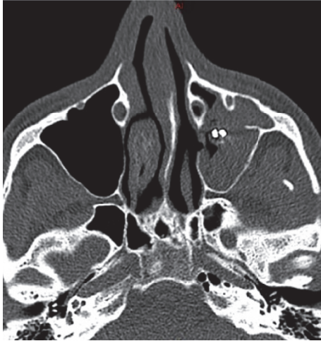
FIGURE 1: CT facial scan that shows the aspect of an endosinusal foreign body.

T2-weighted magnetic resonance imaging (MRI) could be useful, where calcifications and paramagnetic metals [1] generate areas of signal void in correspondence with the diseased tissue [1, 6].