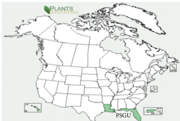
FIGURE 1: USDA plant database. distribution of guava in USA.

The genus Psidium belongs to the family Myrtaceae, which is considered to have originated in tropical South America. Guava crops are grown in tropical and subtropical areas of the world like Asia, Egypt, Hawaii, Florida (Figure 1), Palestine, and others. The genus Psidium comprises approximately 150 species of small trees and shrubs in which only 20 species produce edible fruits and the rest are wild with inferior quality of fruits [11]. The most commonly cultivated species of Psidium is P. guajava L. which is the common guava. Other species are utilized for regulation of vigor, fruit quality improvement and resistance to pest and disease [11]. Guava fruit today is considered minor in terms of commercial world trade, but it is widely grown in the tropics, enriching the diet of hundreds of millions of people in those areas of the world.