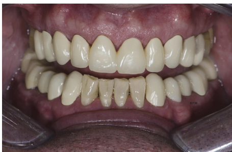
FIGURE 3: Clinical evaluation of the aesthetic and functional outcome of the provisional.