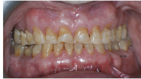
FIGURE 1: Intraoral preoperative conditions. Notice widespread cervical abrasions and abfractions.

2.2. Intraoral Scan. All the impressions required for the implementation of the arranged treatment plans were taken using a Planmeca PlanScan intraoral scanner (Planmeca OY, Helsinki, Finland). This is a device that relies on short wavelength laser light projection (450 nm). The scanner does not require the application of powder on the intraoral surface and it has several interchangeable autoclavable tips, in various sizes, to suit the clinical situation. It can be used simply by connecting it to a computer or prepared dental unit, allowing it to be operated easily in various workstations. In addition, the scanning software allows digital casts to be exported in the open STL format, giving the clinician complete freedom in the management of the subsequent stages of the prosthetic rehabilitation using Exocad software (Exocad GmbH, Germany, 2010).