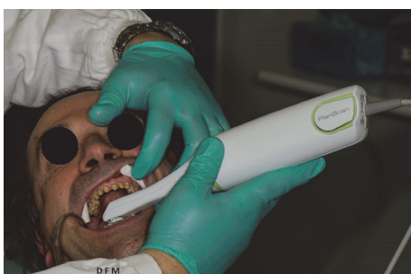
FIGURE 4: Intraoral digital scan of the preparations of both dental arches.

Temporary PMMA restorations were cemented with eugenol-free cement (Temp Bond NE, Kerr GmbH, Rastatt, Germany, or Freegenol, GC, Bad Homburg, Germany).