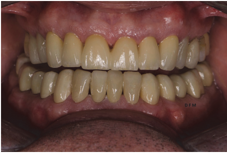
FIGURE 7: Clinical intraoral result after cementation.

Schaan, Liechtenstein), colored with IPS e.max CAD Crystall Shades (Ivoclar-Vivadent, Schaan, Liechtenstein), and crystallized in ceramic furnaces following the manufacturer's instructions.