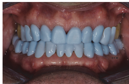
FIGURE 5: Clinical test and evaluation of the definitive crowns design through the 3D printed crowns: analysis of the finishing lines, interproximal areas, occlusal contacts, and aesthetic result.