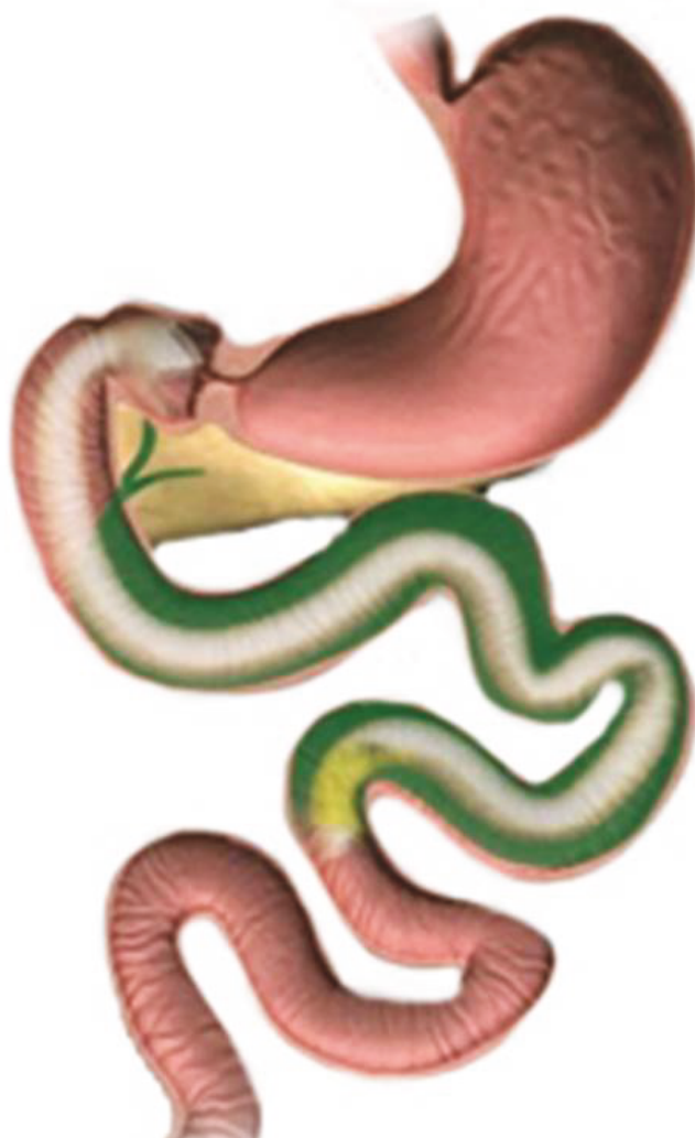
FIGURE 2: Bile flowing around the outside of the sleeve coming into contact with nutrients distally in the jejunum.