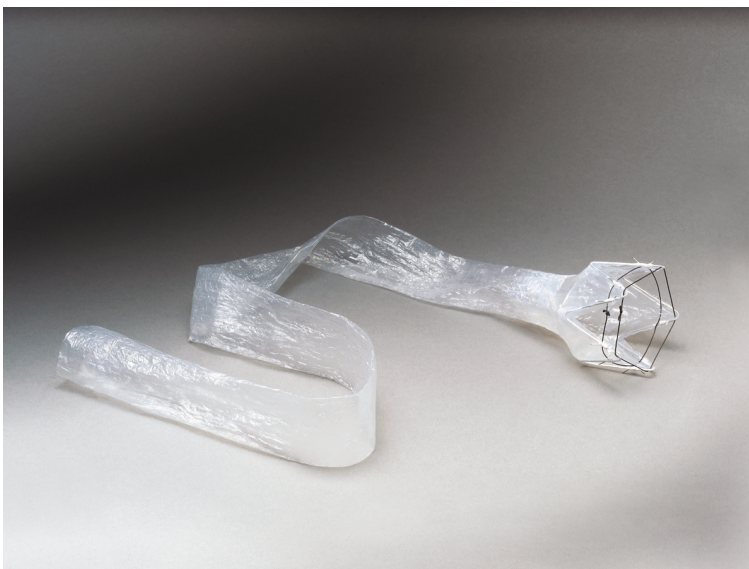
FIGURE 1: The EndoBarrier device.