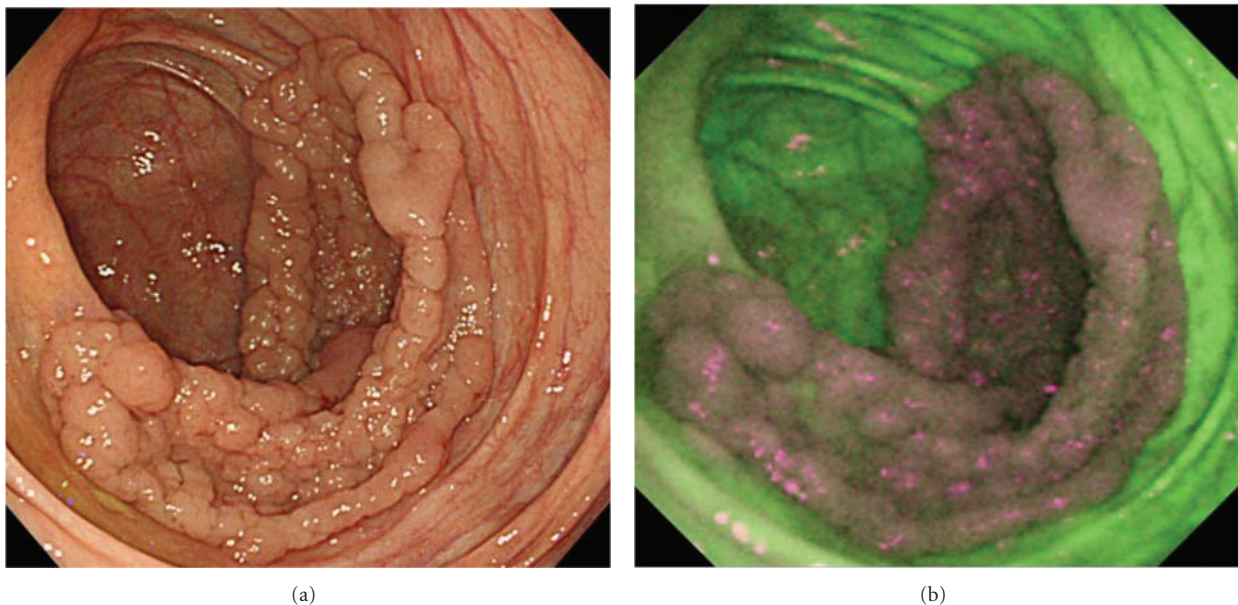
FIGURE 3: WLE image of 5-cm lateral spreading tumor (granular type) in cecum (a). With AFE, the lesion appears purple, which provides a strong color contrast with the surrounding normal mucosa shown in green (b).

A back-to-back comparative study by Ramsoekh et al. [22] analyzed the sensitivity of AFE and WLE for the detection of colorectal adenomas in high-risk patients from families with the Lynch syndrome or familial CRC. A total of 75 asymptomatic patients were examined with either WLE followed by AFE or AFE followed by WLE. Back-to-back colonoscopy was performed by two blinded endoscopists. WLE identified adenomas in 28/41 patients and AFE in 37/41 patients, representing a 32% difference in detection efficacy. In total, 95 adenomas were detected, 65 by WLE and 87 by AFE, indicating a significantly higher sensitivity of AFE