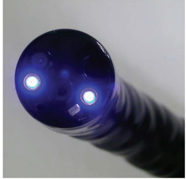
FIGURE 1: High-resolution videoendoscope (CF-FH260AZI) used in the autofluorescence imaging system (Olympus Medical Systems Corp, Tokyo, Japan).

The autofluorescence imaging system from Olympus (AFI system) is the latest AFE system and is equipped with high-resolution videoendoscope capabilities (CF-FH260AZI, Figure 1). This system uses a switching function between the WLE and AFE mode and the NBI mode, a zoom function, and variable stiffness function. Figure 2 sets out mechanistic details of the AFI system, in which false color images are ultimately produced by allocating the amplified autofluorescence signal to the green (G) channel and the reflected signal of green light to the red (R) and blue (B) channels in the ratio of 1 to 0.5. The endoscopic image is displayed in false color; areas with low and high autofluorescence intensity are shown in purple and green