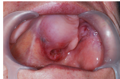
FIGURE 3: Adenoid cystic carcinoma of the left maxilla.

Initial histologic diagnosis of MSGTs was obtained with open biopsy in 39 cases, fine needle aspiration cytology (FNAC) in 19 patients, and intraoperative frozen section analysis in 8. The results consistent with the final diagnosis were obtained in 7 FNAC examinations only, including 2 cases of malignant MSGTs. In two out of 14 open biopsies of benign MSGTs and in one out of 25 open biopsies of malignant tumours, the results were opposite to the final diagnosis. The results obtained by frozen section analysis showed negative resection margins in 8 cases. In 4 cases,