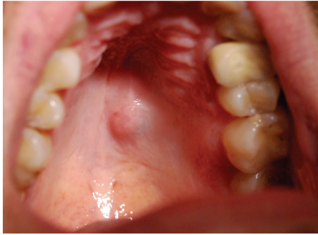
FIGURE 1: Adenoid cystic carcinoma of the hard palate.