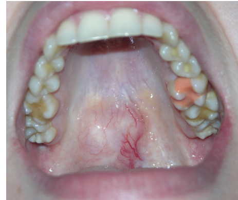
FIGURE 2: Pleomorphic adenoma of the junction between the soft and hard palate.

years. The mean age of the patients with benign MSGTs was lower (48.3 years) than of those with malignant MSGTs (51.3 years).