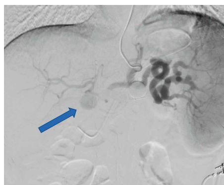
FIGURE 2: Angiography case 1, performed POD #85 showing hepatic artery pseudoaneurysm (arrow).