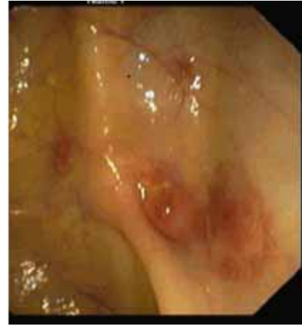
FIGURE 1: Colonic mucosa showing haemorrhagic patches.

KS is a multicentric and angioproliferative tumour with an increased incidence both in organ transplant recipients,