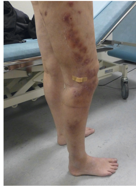
FIGURE 2: Photography of the patient with bluish red indurated patches of the right lower leg extending up through the lateral part of the thigh, with swelling of the entire right leg. The patient had covered an ulcerating element with band aid.

Methotrexate was prescribed, but the skin elements worsened, and she was admitted with abdominal pain. Enlarged mediastinal and axillary lymph nodes were