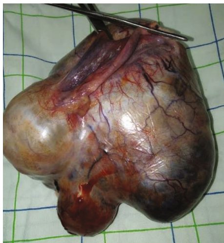
FIGURE 3: The surgical specimen consists of the left ovary. The cyst wall is smooth and glistening.

the ovarian stroma packed around the cyst [7]. Its content is liquid, most often sebaceous type and much more rarely serous type. You can also find hair in the cyst. Quite frequently, a solid nodule is attached to the inner side of the cystic wall, called the Rokitansky nodule or protuberance. It is in this protuberance that the derivatives of 3 layers of stem cells are found: nerve tissue, dander, adipose tissue, gastrointestinal mucosa, etc. The visible hairs within the cyst are derived from this nodule.