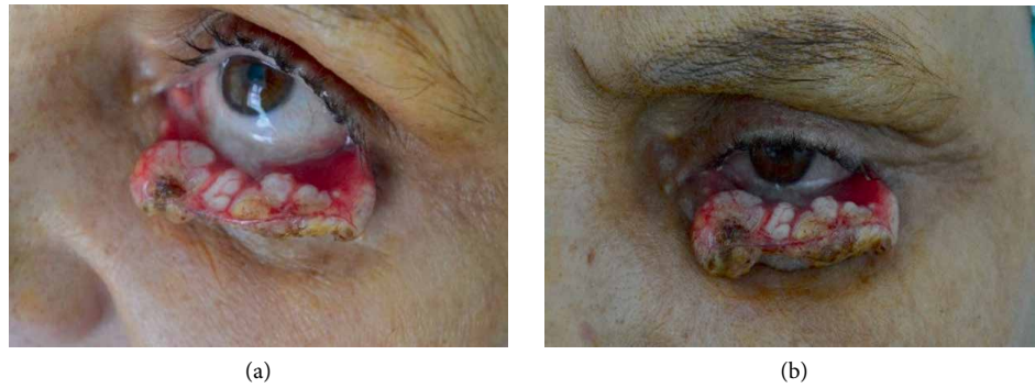
FIGURE 1: Giant squamous cell papilloma involving the left lower eyelid (a) and (b).