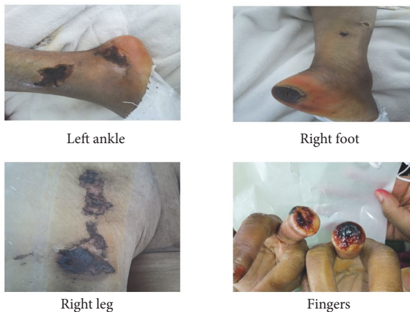
FIGURE 1: Topography and aspect of Calciphylaxis lesions of patient 1.

and symmetrical peripheral pulses. Its biological assessment revealed phosphocalcic balance disorders with an elevated parathormone (PTH) and alkaline phosphatase (PAL) at 919 pg/ml and 348 UI/l, respectively, a calcium level at 2.2 mmol/l under calcium carbonate, a normal serum phosphorus at 1.03 mmol/l, a vitamin D deficiency at 14.2 ng/ml, and normocytic normochromic anemia. Dosage of prothrombotic factors (C and S proteins, antiphospholipid antibodies, anticardiolipin antibody, anti-b2 glycoprotein 1 antibody, circulating anticoagulant, and cryoglobulinemia) was normal. Cervical ultrasound has found bilateral parathyroid nodules. X-rays of the skeleton showed bone demineralization with extensive calcification of the vessels. The patient initially received symptomatic treatment with an opioid analgesic (Tramadol sometimes associated with Nefopam), blood transfusion, and erythropoietin to correct anemia.