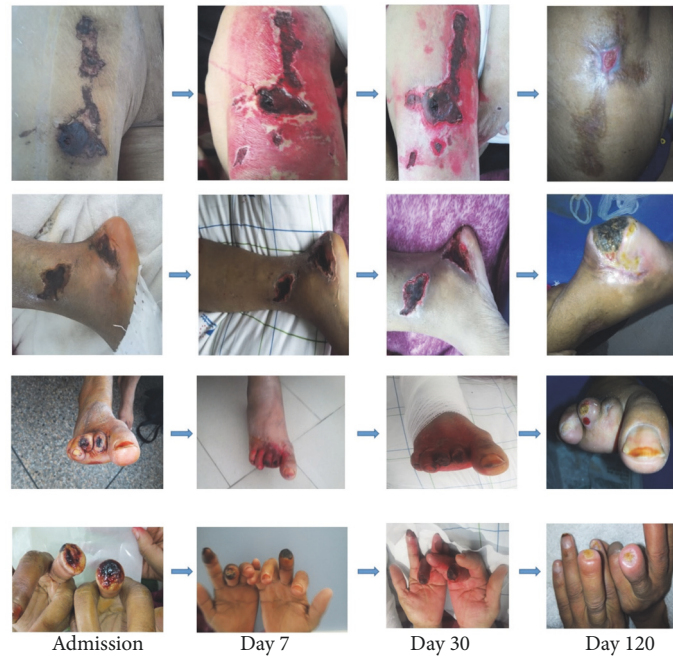
FIGURE 2: Evolution of Calciphylaxis lesions over 4 months of treatment in patient 1. Necrosectomy could not be performed at the heels because of the risk of injury to the Achilles tendon.