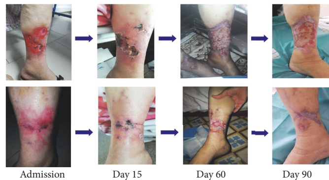
FIGURE 5: Evolution of Calciphylaxis lesions over 3 months of treatment in patient 2.

The evolution is done in a few days towards the formation of superficial and then deep ulcerations leading to the constitution of a blackish eschar, always strongly painful with centrifugal extension [11].