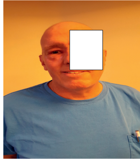
FIGURE 5: Significant resolution of the right periorbital edema and erythema was noted after 3 cycles of chemotherapy. The right eye was eventually able to fully open.

ENKL, nasal type, usually affects the sinonasal region first with extension into the ipsilateral periorbital tissues [2–4]. Clinical manifestations of nasal ENKL include signs and symptoms of recurrent chronic sinusitis, periorbital swelling, chemosis, or proptosis [3, 4]. Rarely, there have been reported cases of periorbital involvement without sinusitis [5]. The diagnosis of nasal ENKL is almost always delayed because of its rarity and oftentimes treated as chronic or acute on chronic sinusitis during initial presentation.