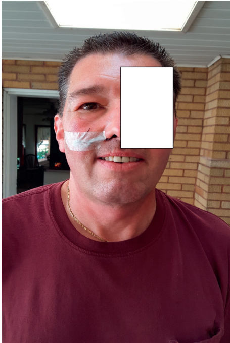
FIGURE 1: Reduction of swelling and erythema was noted around the right paranasal sinuses and right eye after nasal washout.

was discharged to complete a 2-week course of oral cephalexin for MSSA bacterial sinusitis.