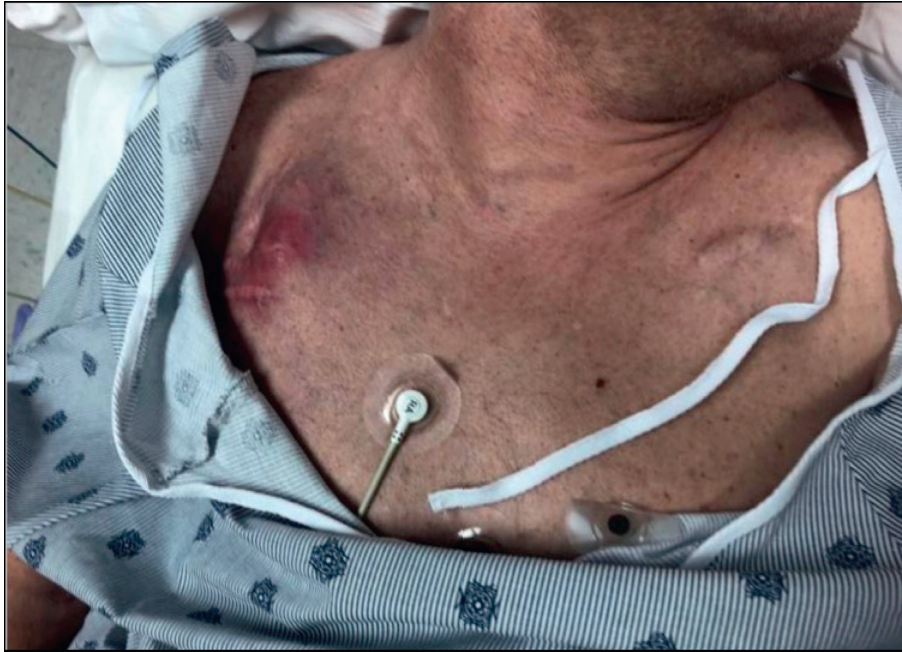
FIGURE 1: Patient's chest at initial presentation to the emergency department, with erythematous fluctuance at the pocket of his previous right-sided pacemaker visible.

In regards to his cardiac history, the patient had required extensive surgical management of his complete heart block. He had a permanent pacemaker (PPM) implanted at 22 years of age for this condition, which had since required three different surgeries for pulse generator and cardiac lead replacement and revision. At the time of his presentation to the ED, the patient had a dual chamber PPM in the left chest implanted 6 years prior; he also had the aforementioned pocket in his right chest, a potential space remaining after the removal of his previous PPM. Additionally, he had two retained ventricular leads from another previous pacemaker embedded in his myocardium, which had been trimmed back as much as possible and capped off, but never removed since they could not be safely extracted. The exact lengths of the retained leads were not discussed in the postoperative reports.