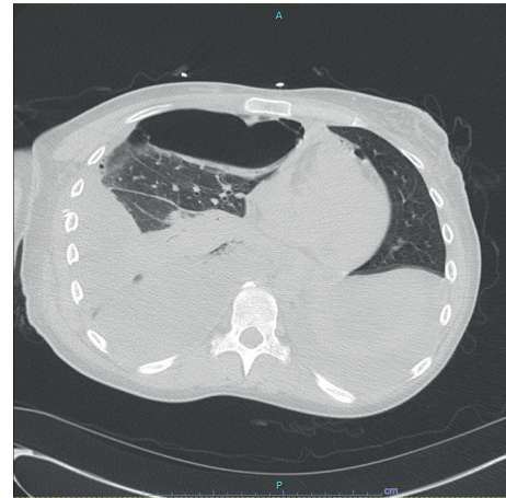
FIGURE 1: Computed tomography (CT) of the chest without contrast: moderate-large loculated right pneumothorax anteriorly with mediastinal shift to the left suggesting tension component and small volume pneumomediastinum.