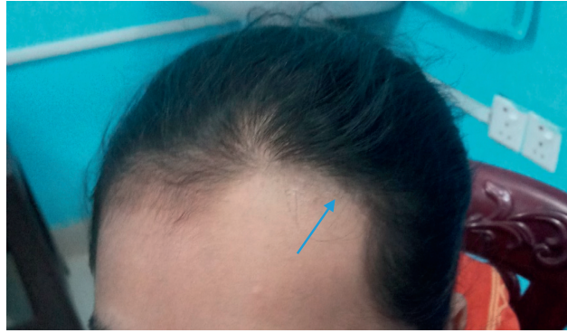
FIGURE 1: Hair loss over the forehead.