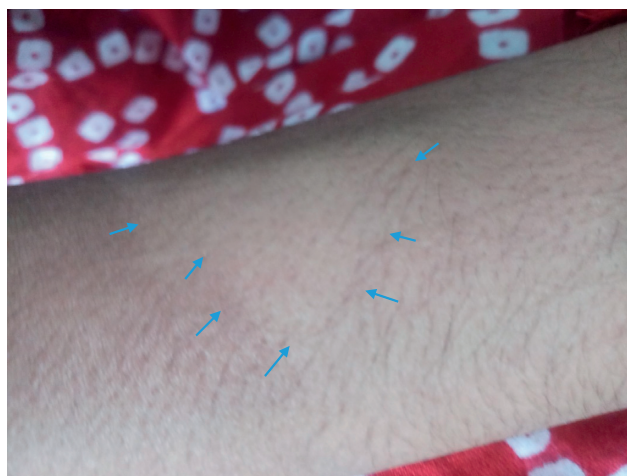
FIGURE 3: Dermoscopic appearance of forearm.