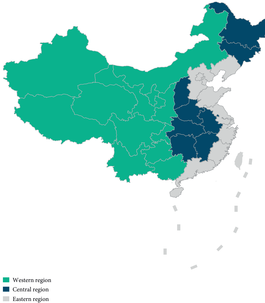
FIGURE 2: The western, central, and eastern regions of China.