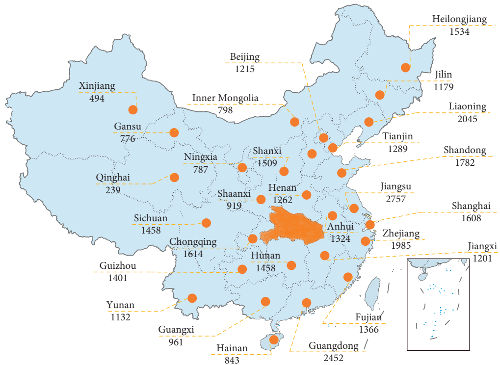
FIGURE 3: Healthcare workers dispatched to assist Hubei Province amid COVID-19 pandemic [13].

day 21 to day 28. The reported mortality in ICU was 34% at 28 days and 52.2% at 13 weeks [15].