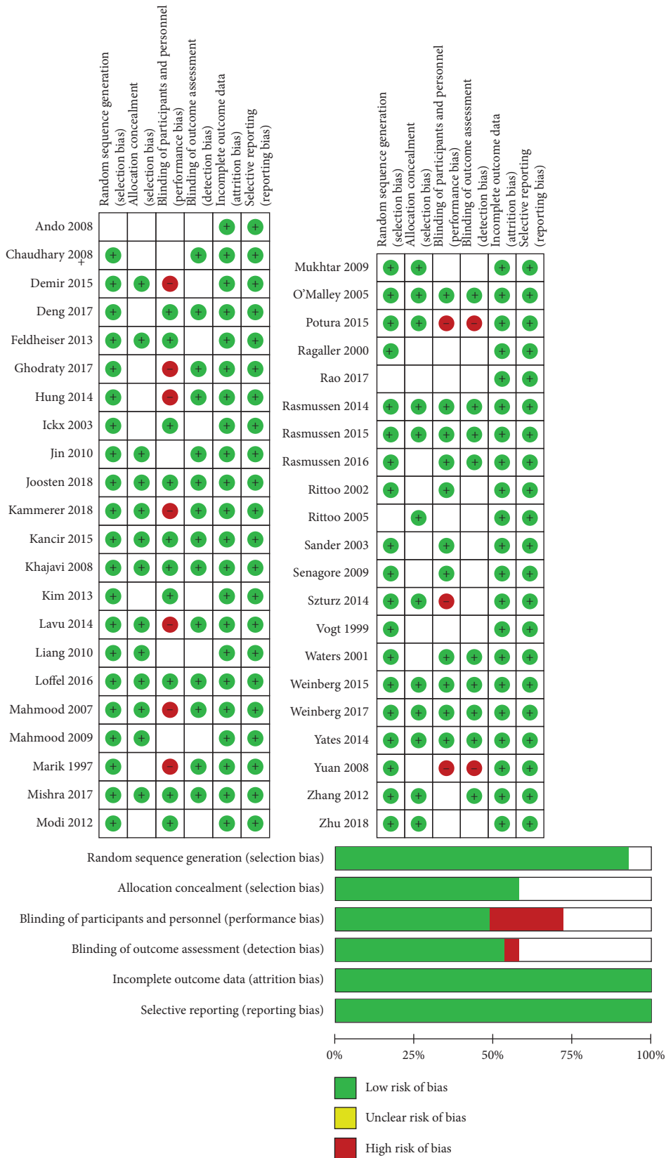
FIGURE 2: Risk of bias of original studies.