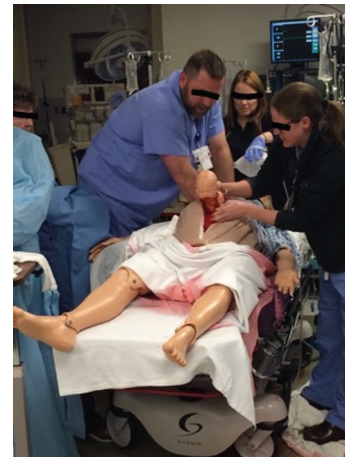
FIGURE 3: Residents performing emergent perimortem cesarean section.

Residents performed a perimortem cesarean section during all simulations. However, we observed an unexpected trend with almost all groups choosing to perform a Pfannenstiel skin incision and a low transverse uterine incision, contrasting with the current practice guidelines that favor a midline vertical incision (see Figure 3). Residents reported feeling they would be more proficient and could expedite delivery using this approach. This decision-making process has been supported in the literature by other authors [18, 19]. Group debriefing highlighted the advantages of a midline abdominal incision particularly for cases of abdominal