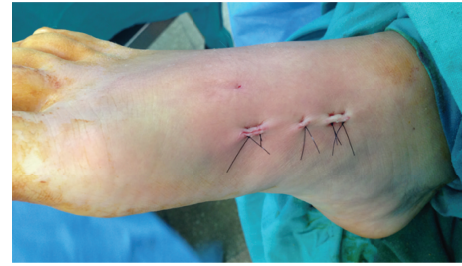
FIGURE 3: Clinical result after MIS Lisfranc bridge plating.

According to the radiological criteria established, the joint reduction was anatomical in four patients, almost anatomical in one patient (#4), and nonanatomical in none of the