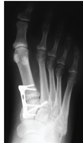
FIGURE 4: Initial postop. Rx showing congruency of the first two columns.

patients. At the final follow-up, the AOFAS score for the mid-foot was 96 points (range, 95–100). The patients subtracted points more often due to mild pain, limitations in recreational activities, and the impossibility of wearing fashionable shoes. As for subjective satisfaction, all the patients reported they were pleased with the procedure and the results obtained. The mean score according to the VAS (Visual Analog Scale) at the end of the follow-up period was 1.4 points over 10 (range, 0–3). All the patients achieved complete weight load at an average of 42.4 days (40–46) considering the initial premise of no body weight bearing for 6 weeks. None of the patients required assistance or braces (for the foot, splints or orthopedic shoes, etc.) after restarting their daily activities. The osteosynthesis material was removed in all patients as scheduled after an average of 17 weeks (range, 16–18). No complications (soft tissue or bone infection, delayed healing, chronic pain, etc.) were recorded.